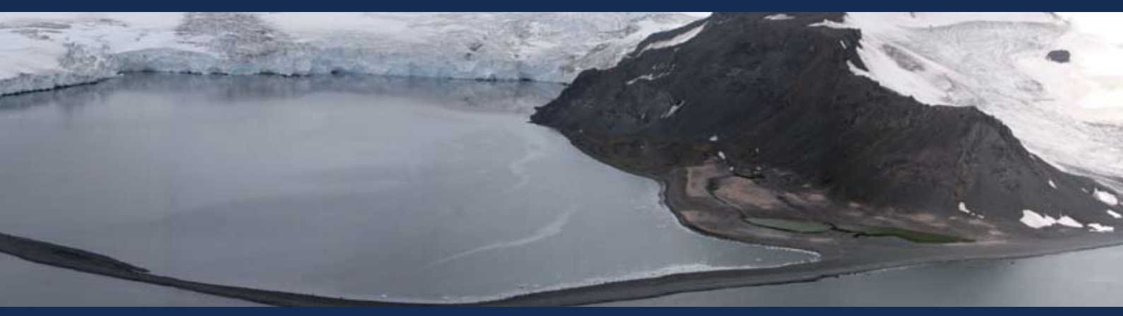
Yankee Harbour from above: showing the gravel spit enclosing the landing beach