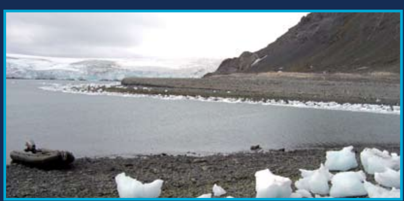
Yankee Harbour landing site